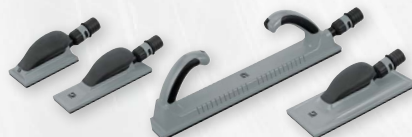
22090 22091 22092 22093 D-BLOCK SANDERS