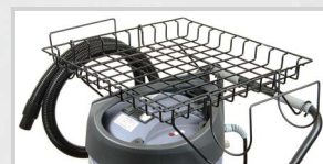
96563 VACUUM TRAY/ OPTIONAL VACUUM HOSE HANGER (For use with Mega-Raptor Standard Packs)