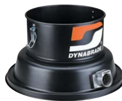
INTERFACE RING 62346 — For use with Models 61204 & 61205