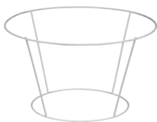
FILTER CAGE 32014 — For use with Model 61205