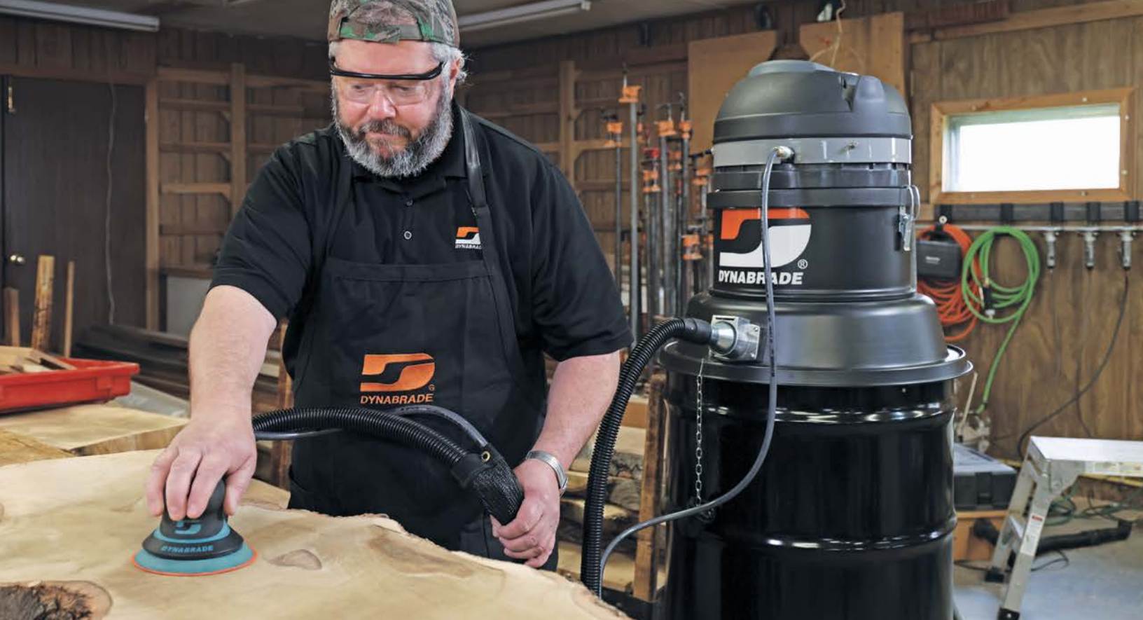
61202 - DRY SINGLE OPERATOR GENERAL PURPOSE