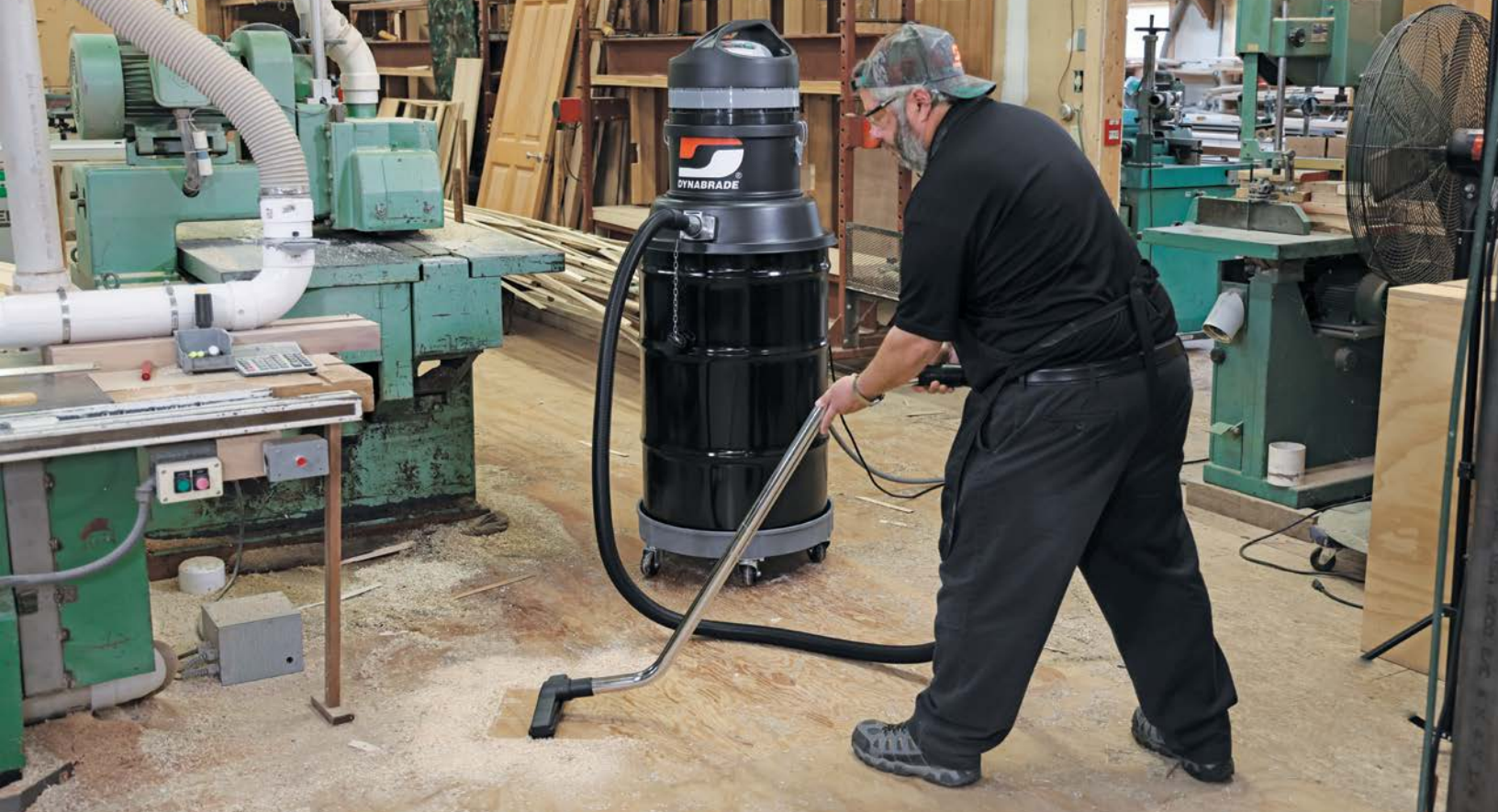
61200 - DRY SINGLE OPERATOR GENERAL PURPOSE