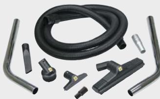
GENERAL PURPOSE CLEANING KIT 96746