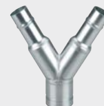
Y INLET 32011