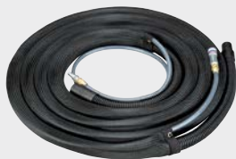
VACUUM HOSE WITH INTEGRATED AIR LINE 32005