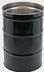
55 GALLON DRUM 32016