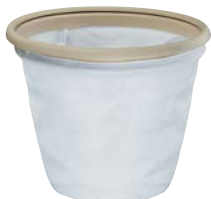
HAT FILTER 32013 — For use with Model 61204