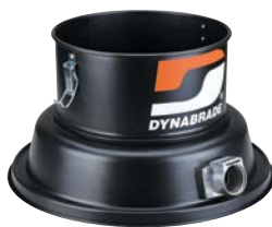
INTERFACE RING 62347 — For use with Models 61202 & 61203