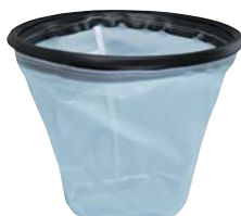
WET FILTER 32015 — For use with Model 61205