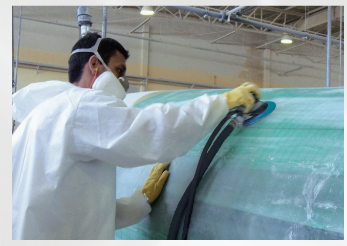
Sanding applications have a high likelihood of generating static electricity.