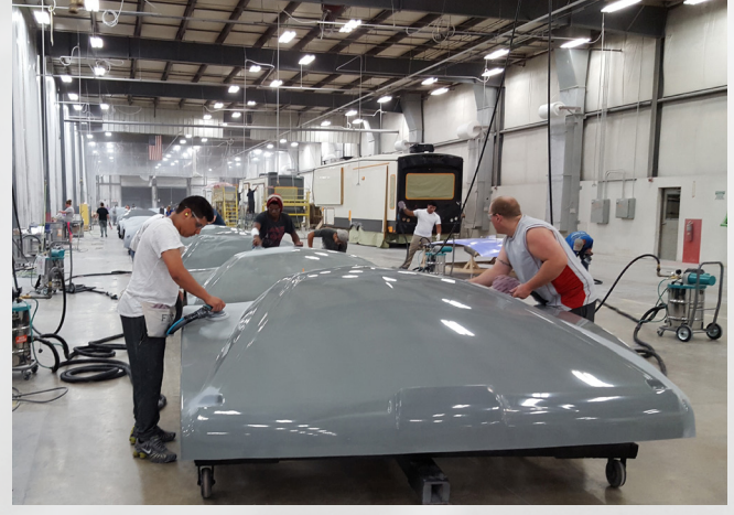
Dynabrade tools and vacuums contribute to the optimization of applications and environments.