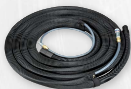
31972 20' HOSE ASSEMBLY 1" Vacuum Hose with 5/16" Airline