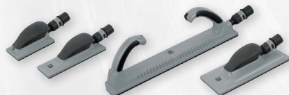
22090 22091 22092 22093 D-BLOCK SANDERS