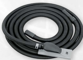
31919 20' D-BLOCK HOSE ASSEMBLY (shown with DYB22093 D-Block, sold separately)