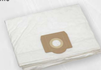
96623 VACUUM BAG