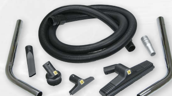
96607 CLEANING KIT