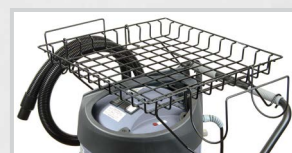
96563 VACUUM TRAY/ OPTIONAL VACUUM HOSE HANGER (For use with Mega-Raptor Standard Packs)