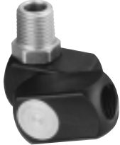
Dynamswivel® Swivels 360° at two locations which allows an air hose to drop straight to the floor, no matter how the tool is held. • 94300 1/4" NPT