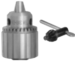
53032 – 1/4" Drill Chuck Includes: 53052 Mated Chuck Key