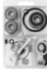
95600 Motor Tune-Up Kit: • Includes assorted parts to help maintain and repair motor.