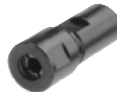
50066 1/4" Collet Assembly.