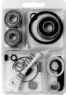
96672 – Motor Tune-Up Kit