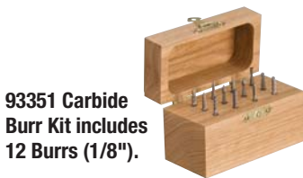
93351 Carbide Burr Kit includes 12 Burrs (1/8").

Ask About Additional Dynabrade Pencil Grinders!