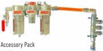
Accessory Pack 22070