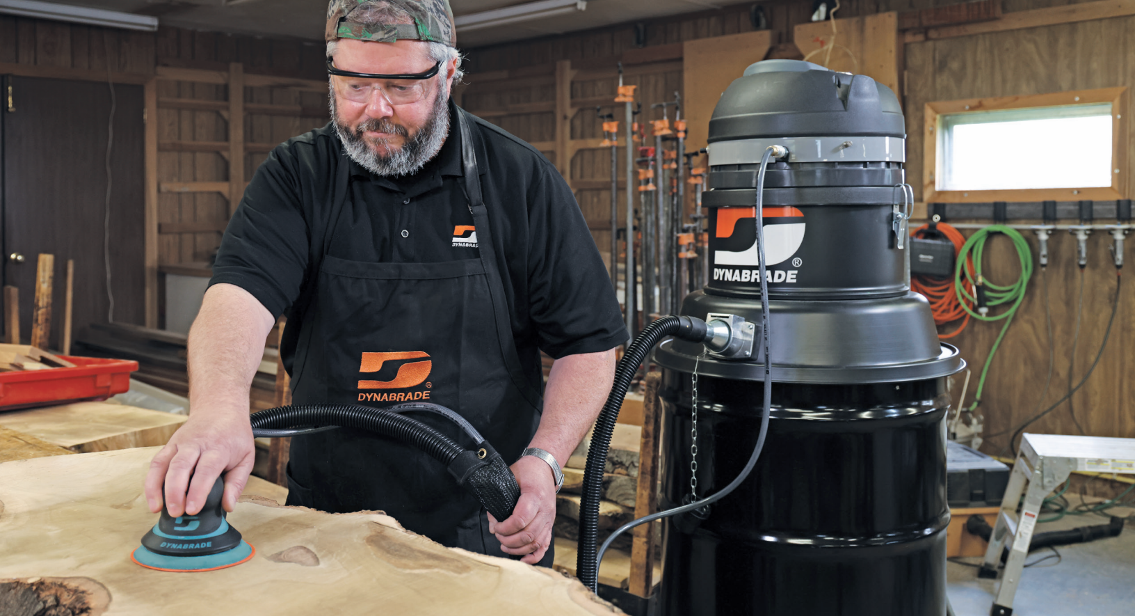
61202 - DRY SINGLE OPERATOR GENERAL PURPOSE