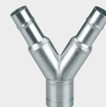
Y INLET 32011