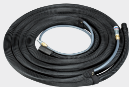
VACUUM HOSE WITH INTEGRATED AIR LINE 32005