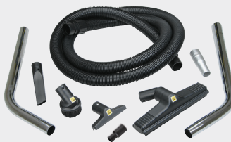
GENERAL PURPOSE CLEANING KIT 96746