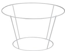
FILTER CAGE 32014 — For use with Model 61205