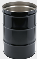
55 GALLON DRUM 32016