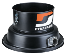
INTERFACE RING 62347 — For use with Models 61202 & 61203