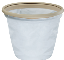
HAT FILTER 32013 — For use with Model 61204