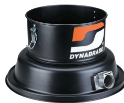
INTERFACE RING 62346 — For use with Models 61204 & 61205