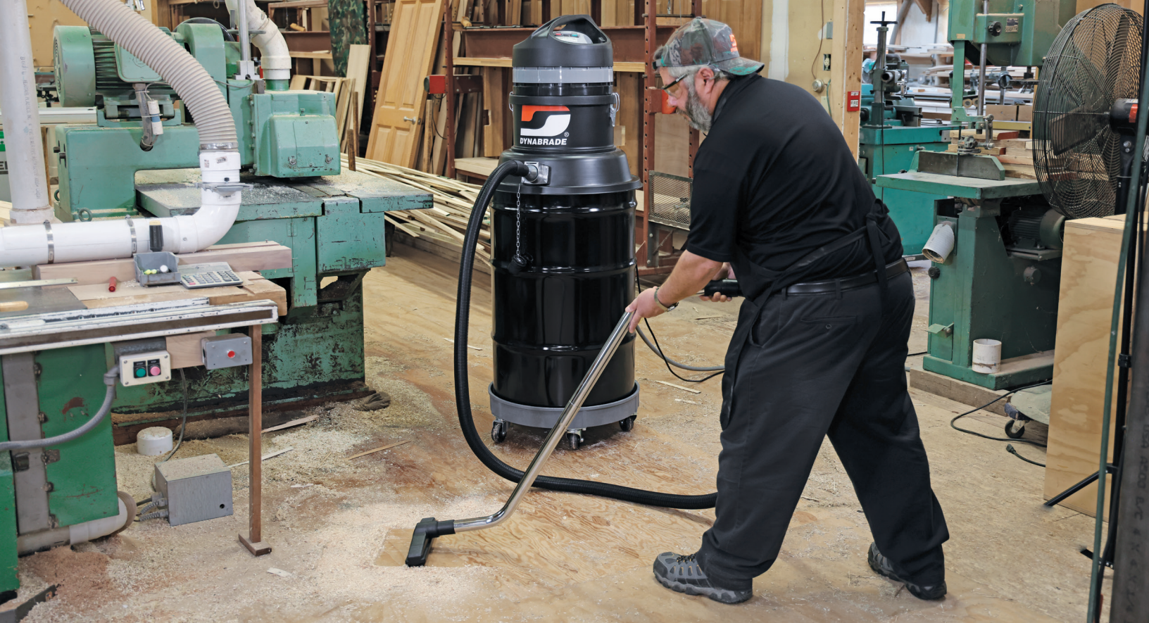
61200 - DRY SINGLE OPERATOR GENERAL PURPOSE