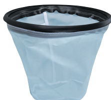
WET FILTER 32015 — For use with Model 61205