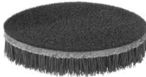
90840 Short-Nap 3-1/2" Cleaning Brush