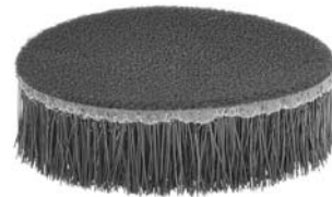
90841 Long-Nap 3-1/2" Cleaning Brush